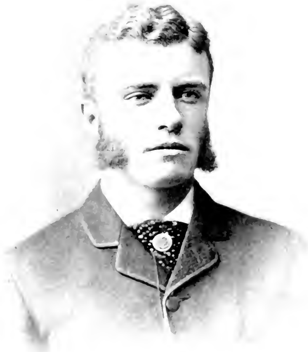
THEODORE ROOSEVELT At the time of his Graduation in 1870